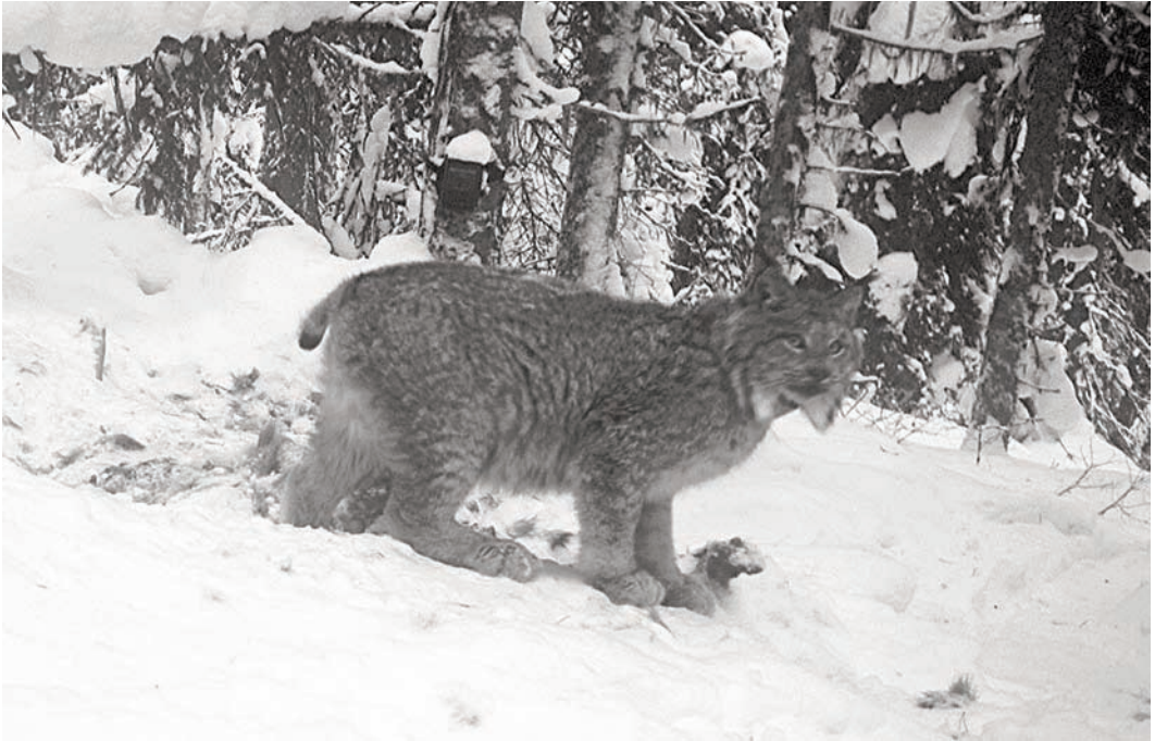
FIGURE 2. Remote camera photo of a Canada Lynx at the carcass of a Mule Deer it killed in the southern Canadian Rocky Mountains, January 1999.